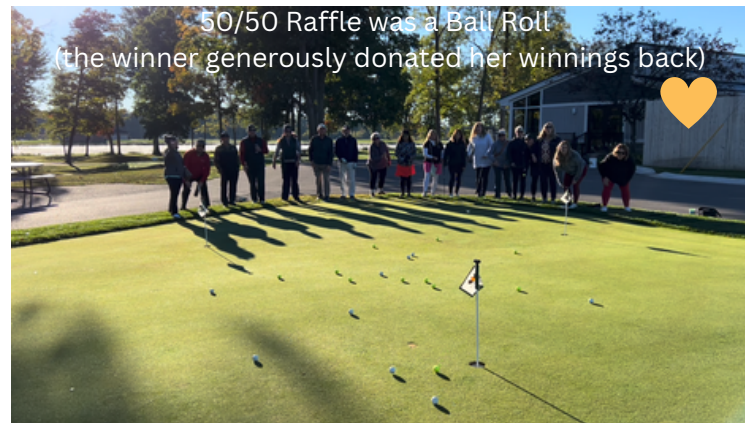
50/50 Raffle was a Ball Roll (the winner generously donated her winnings back)