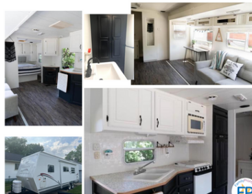
2nd Mobile Shelter Unit

We will continue to host at the Farley house until the mobile shelter reopens in April.