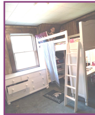
A young lady and her "perfect" bedroom

We are truly blessed to have formed a relationship with our friends at St. Francis Prayer Center.