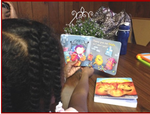
A young guest enjoys a book donated by a friend of FPGC

If you would rather receive this newsletter electronically, please call (810) 234-9444.