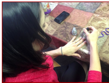
A volunteer assisted guests with their nails and makeup for job interview preparation.