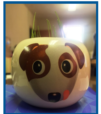
Family project at the Day Center: two of the moms helped their children plant this grass and it grew! The grass isn't the only thing growing though - our families are showing great growth too! Very exciting all around!