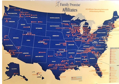
Nationally, Family Promise has 200 affiliates and 39 developing, including one in Battle Creek.

The National Conference engages Directors, Case Managers and Board Members. It offers a little something for everyone. I spent my time focusing on how to grow the opportunities for our guest families and how to expand the network they're connected to, when they graduate. I also learned that Family Promise of Genesee County is putting a lot of the right building blocks in place. When conference presenters talk about a healthy affiliate they talk about actively engaged board members. We have 12 members of our Board of Directors, some of whom have been with us since the beginning and are so excited to see our steady growth. They also talk about establishing a good base of volunteers and we hit the jackpot there! The volunteer door is always open and we have an amazing group of volunteers between our community connections and our host and support churches.