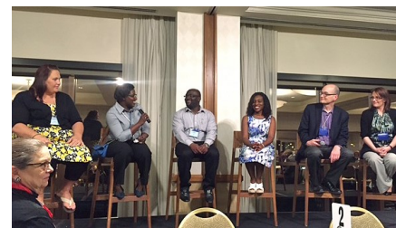
Graduate panel shares stories of success, stories of hope

one father. Talk about inspiring! Two of them earned higher education degrees, one is nearly done with her Masters of Social Work. All are gainfully employed, two with the Family Promise affiliates from which they graduated. Each echoed how the network of caring which surrounded and motivated them made more of a difference than any of those volunteers may ever know. They reminded us that homelessness is hard. Homelessness with children is even tougher, but Family Promise provides hope!