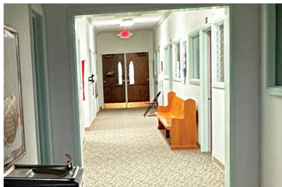
Hallway of the new Day Center

Family Promise of Genesee County is nonprofit, tax-exempt 501(c)(3) organization addressing the crisis of family homelessness in Genesee and Lapeer Counties. Through a comprehensive set of solutions involving prevention, shelter, and stabilization, we empowers families experiencing or at risk of homelessness to reclaim and maintain their independence.