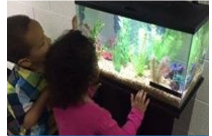
"Just keep swimming..."